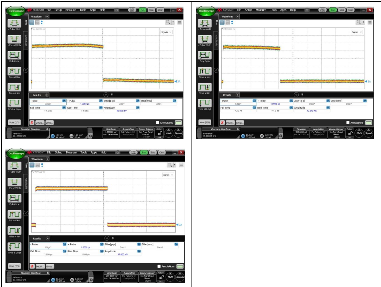
Few microseconds optical pulse responses

The EOM transfer function curve (sine response) is taken into consideration: into the ModBox software is registered the inversed EOM response. Thus, from the ModBox interfaces (GUI and tactile screen), or by downloading a txt file, user draws the wanted optical pulse waveform and the system generates in real time the exact and expected pulse waveform. From the above screen shots, the yellow curves are the optical pulse drawn by the user, and in blue the corresponding curves generated by the AWG. One can see the cleanness of the optical pulses.